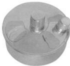
3501 ALCOHOL LAMP