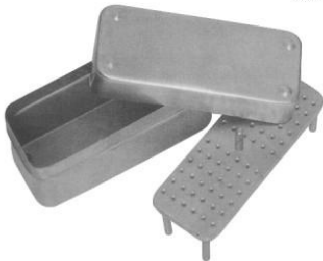
3503 ENDO TRAY BOX