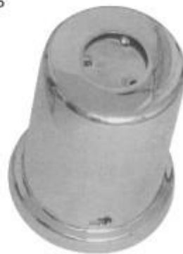
3504 COTTON DISPENSER